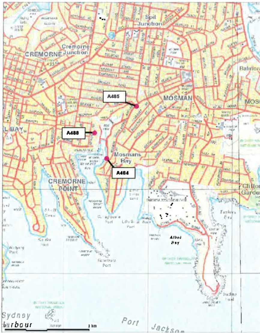
Figure 1: Location of Local Archaeological Heritage Items in Mosman