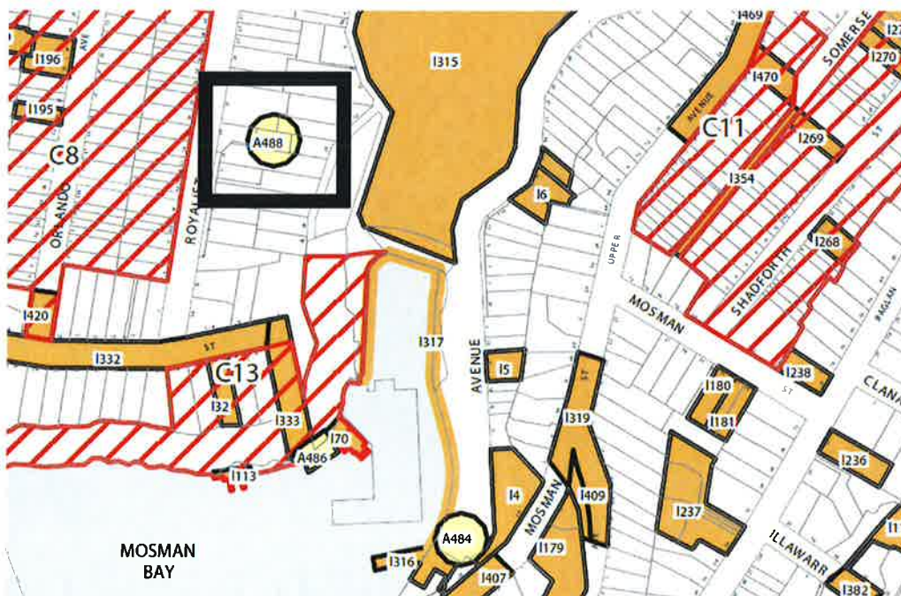
Figure 4: Location of Local Archaeological Heritage Item A488 (shown in black box)